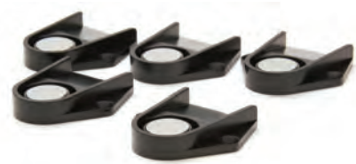
HI920005 Tag holders with tags (5)

Install tags near your sampling points for quick and easy iButton® readings. Each tag contains a computer chip with a unique identification code encased in stainless steel. You can install a practically unlimited amount of tags.