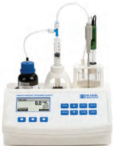
HI84534 Titratable Acidity Mini Titrator and pH Meter Reagents and Accessories