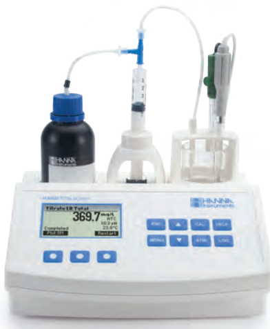
HI84530 Total Titratable Acidity Mini Titrator and pH Meter Reagents and Accessories