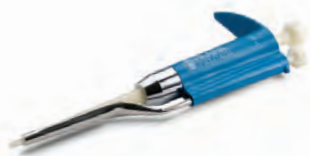
HI731340 200 µL automatic pipette