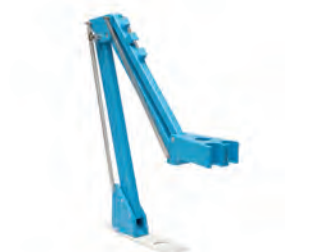
HI76404A electrode holder for HI83300 family