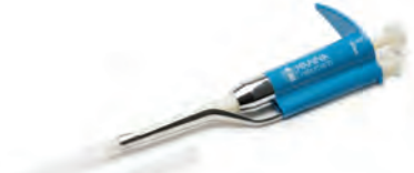
HI731341 1000 µL automatic pipette