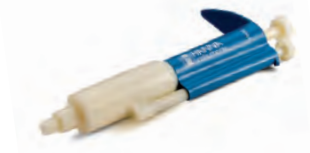
HI731342 2000 µL automatic pipette