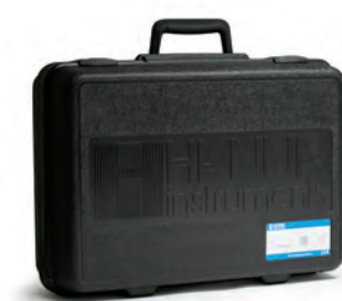
HI72083300 carrying case for HI83300 family