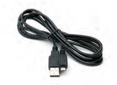
HI920015 USB to micro USB cable connector