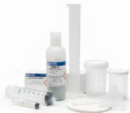
HI83300-100 sample preparation kit consisting of activated carbon for 50 tests, 100 g demineralizer bottle, 170 mL graduated beaker, 100 mL beaker, 3 mL pipette, 60 mL syringe, 5 mL syringe, graduated cylinder, spoon, funnel, paper filters (25)