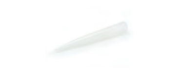
HI731350 200 µL automatic pipette tips (25)