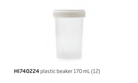
HI740224 plastic beaker 170 mL (12)