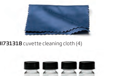
HI731318 cuvette cleaning cloth (4)