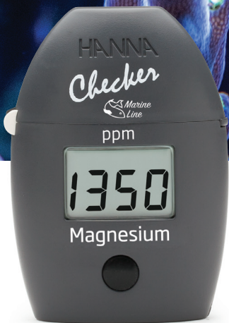
HI783 Checker ® HC Marine Magnesium (ppm) Handheld Colorimeter