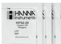
HI702-25 Copper Reagent