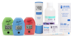
HIREEF-2 Reef Professional Kit