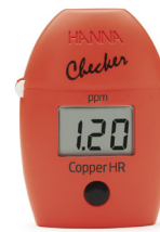
HI702 Copper Checker