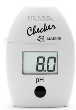
HI780 Marine pH Checker