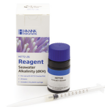
HI772-26 Alkalinity Reagent