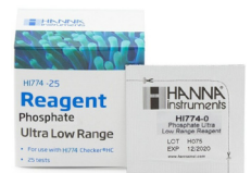
HI774-25 Phosphate Reagent