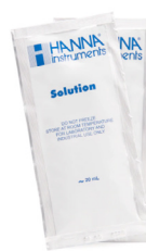
HI70024P Salinity Calibration