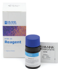
HI781-25 Nitrate Reagents