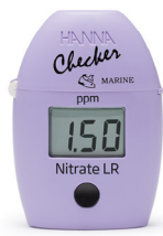
HI781 Nitrate LR Checker