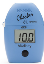
HI772 dKH Alkalinity Checker