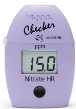
HI782 Nitrate HR Checker

Hanna designs a wide range of analytical instruments that are perfect for aquariums. Our products help take the guesswork out of testing water altogether and generate quick and accurate digital readouts. This enables you and your customers to easily monitor and measure essential parameters for your aquariums.