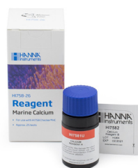
HI758u-26 Calcium Reagent