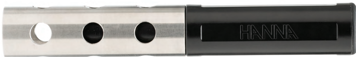
HI764113 with HI764113-3 stainless steel protective shield attached