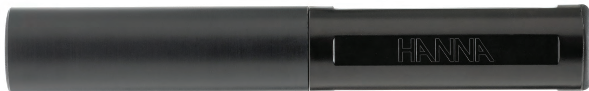
HI764113 with HI764113-2 calibration/storage vessel attached